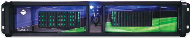
'TV Station in a Box' - Capture, Schedule, Payout, & Stream

HD/SD-SDI, IP Video & Social Media Streaming Server