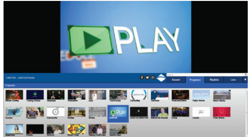
Brandable VOD widget with Iframe support.